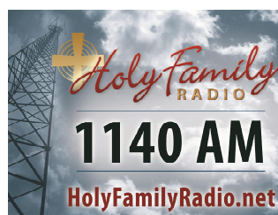
Grand Rapids Sign

Our new yard signs are here! Please call the station at 616-956-1140 or 269-779-7900 to reserve your sign (they are going fast!).