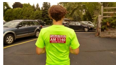
Listener spotted jogging through parking lot!